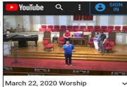
March 22, 2020 Worship