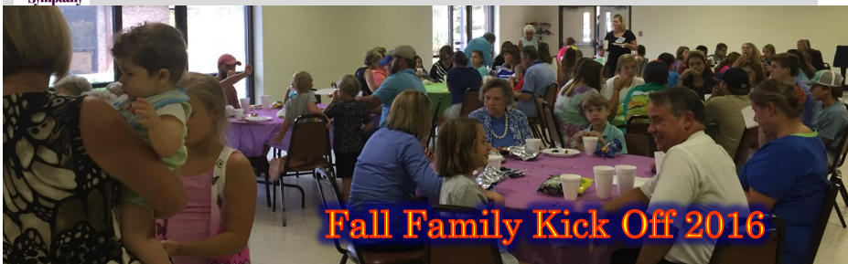
Fall Family Kick Off 2016