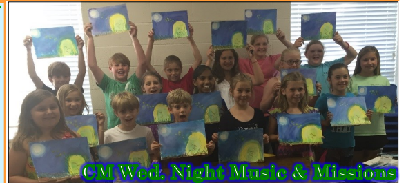
CM Wed. Night Music & Missions

VBS 2016 SURF SHACK June 13th - 17th must have completed 4K - 5th Grade Every child attending must have a completed & notarized FBC 2016 Medical Release & Permission Slip form ~ Registration Deadline: Monday, June 6 ~