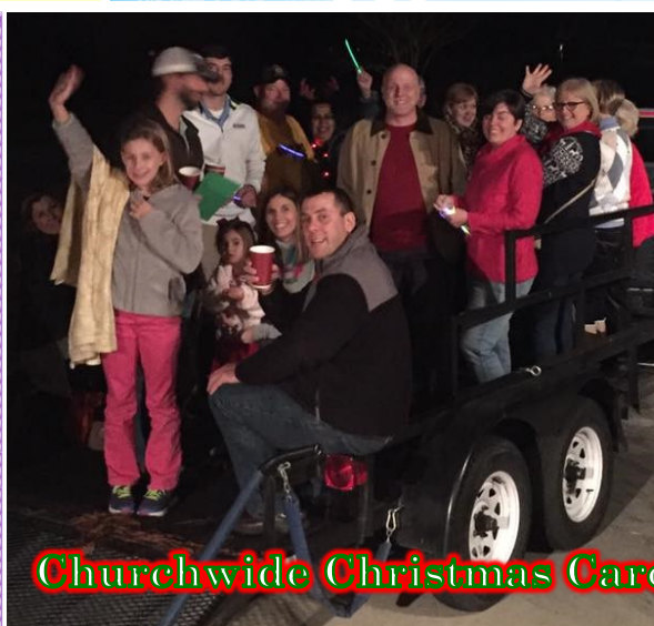
Churchwide Christmas Caroling