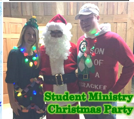
Student Ministry Christmas Party

Sunday, Jan. 29 Combined Worship Service @ 11:00am