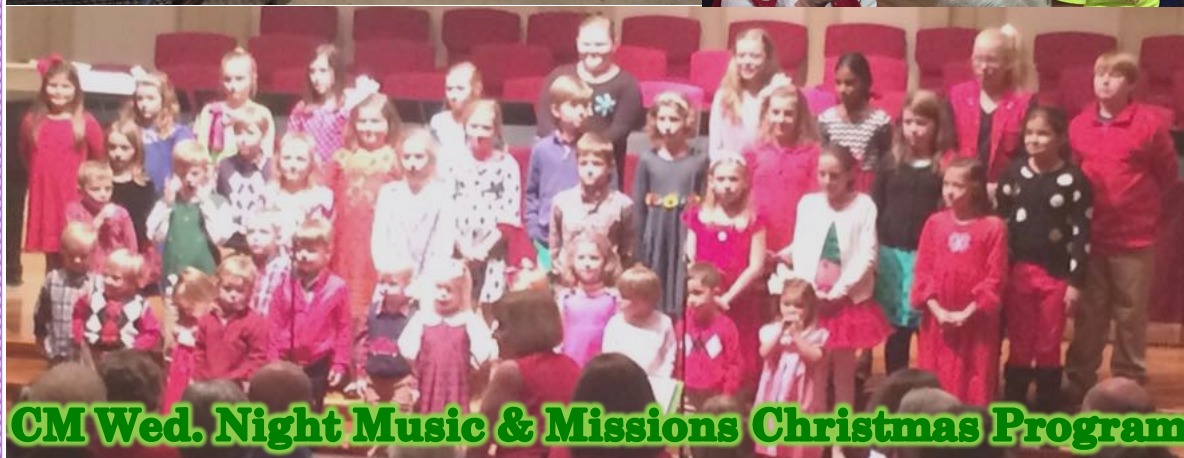
CM Wed. Night Music & Missions Christmas Program