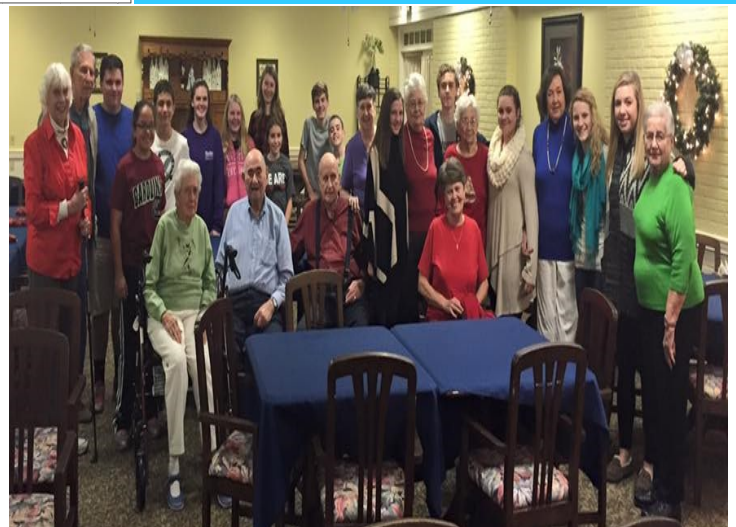
Church-wide Christmas Caroling at The Oaks!

Please email Clary ASAP to secure your child's spot. A $60 deposit will be due on January 31st Parents we will need chaperones (at least 1 who can drive the bus). If you are interested in chaperoning, let Clary know soon, clary@fbcorangeburg.org