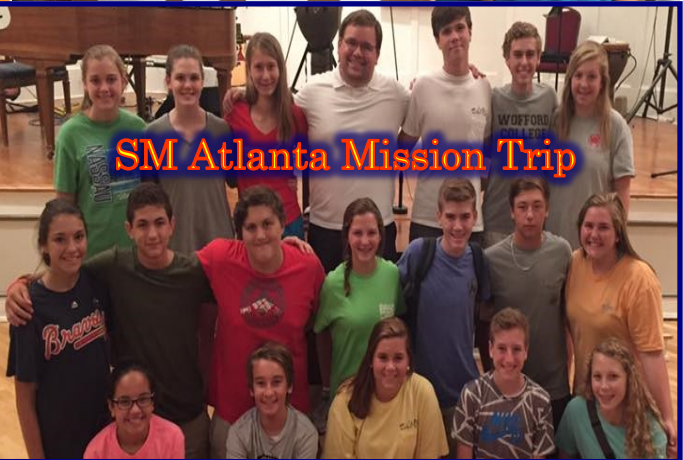
SM Atlanta Mission Trip