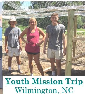
Youth Mission Trip Wilmington, NC